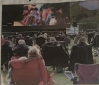
Flashback to last year's Cinema in the Park

During the event, food and refreshments will be available and customers are encouraged to bring their own seats and blankets to sit on. Parking is available in the large car park and blue badge holders will be able to use the accessible spaces at St. Wilfrid's Church car park.